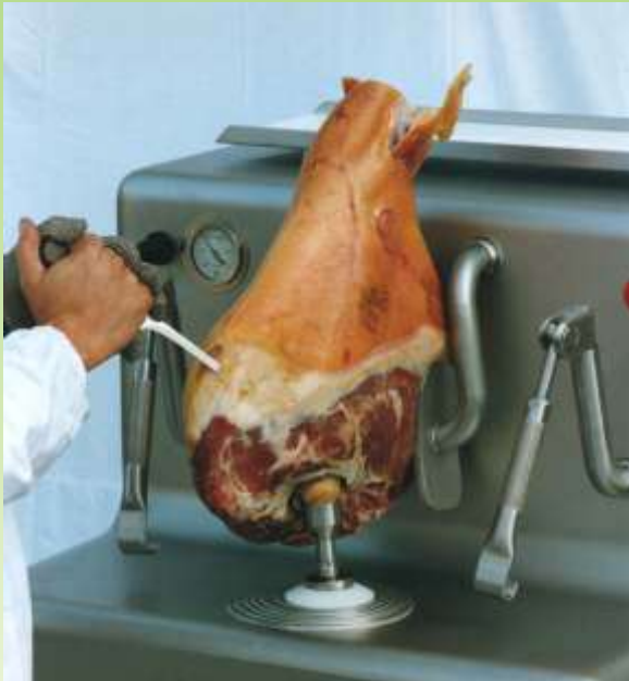
DETTAGLI - DETAILS DETAILS - PARTICULARIDADES