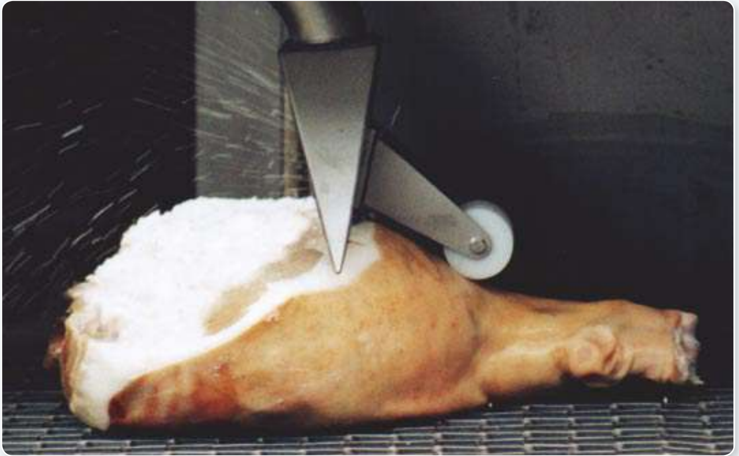
DISSALATRICE AUTOMATICA AUTOMATIC DESALTING MACHINE